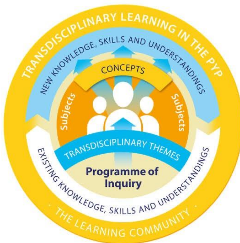
The transdisciplinary elements of the PYP

The programme of inquiry is a long-term plan that provides students the opportunities to evolve their theories, address misconceptions and deepen understandings. Through the programme of inquiry, they build upon what they have learned in previous years, extending their understanding of the transdisciplinary themes as they revisit them throughout the early and primary years of education.